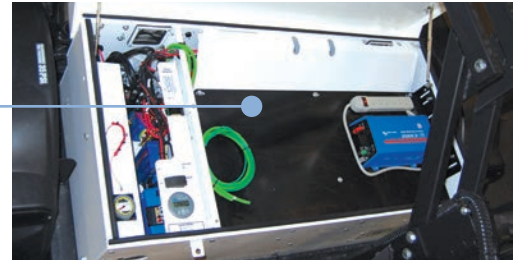
Battery box interior (optional inverter shown)

Large equipment mounting tray inside battery box 15" W × 30" L × 3.5" D