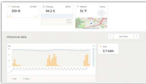
Solar power manager dashboard

For more details or to place an order, call 800.972.0755 or visit wanco.com .