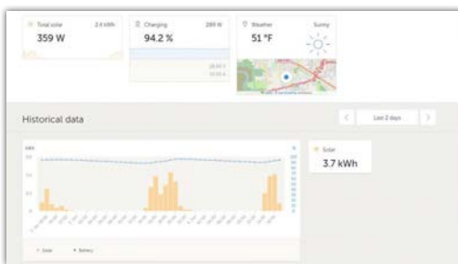
Solar power manager dashboard

For more details or to place an order, call 800.972.0755 or visit wanco.com .